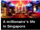
A millionaire's life in Singapore