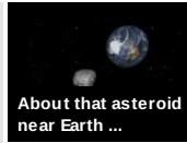
About that asteroid near Earth ...