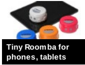
Tiny Roomba for phones, tablets