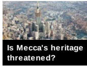
Is Mecca's heritage threatened?