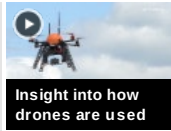
Insight into how drones are used