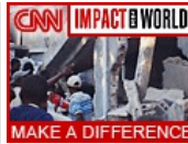
MAKE A DIFFERENCE