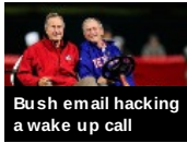
Bush email hacking a wake up call